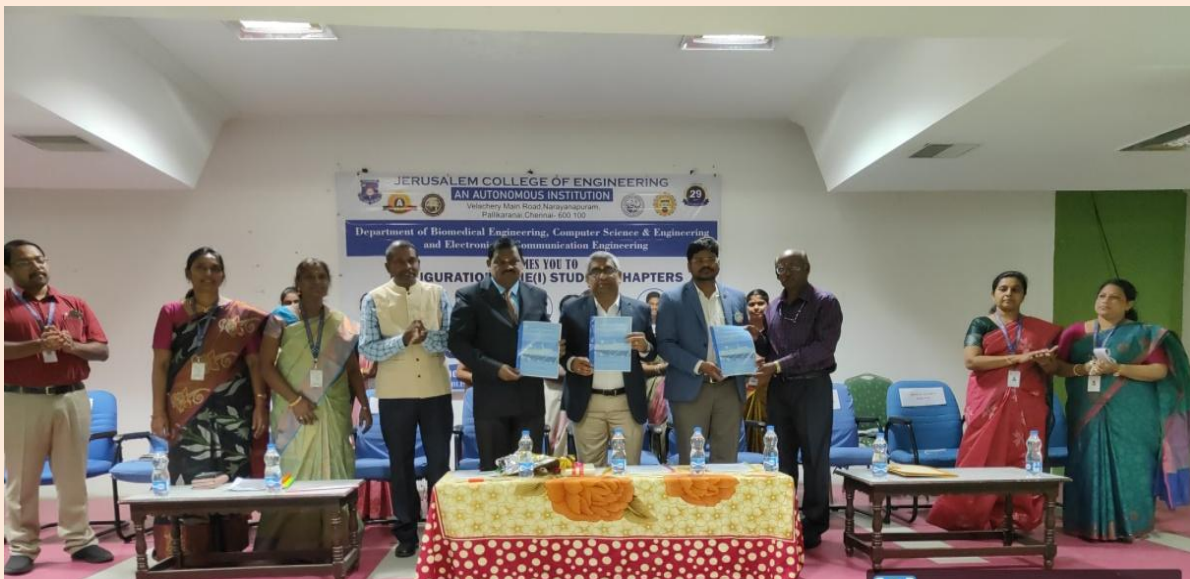
Inauguration of IE(I) Student Chapters- Releasing Souvenir